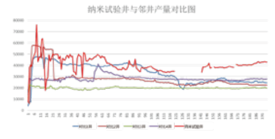
Production Diagram of Nanometer Testing Wells and Adjacent Wells

2 wells had been done in 2018, total stages were 23. The following few sectors all in a relatively high level or leading the industry by comparison with the other wells from same layer in the block: long-term stable production, gas production per unit pressure drop, gas production per unit thickness.